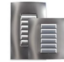
Stainless Steel (Metal)