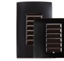
Venetian Bronze (Metal)