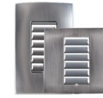
Satin Nickel (Metal)