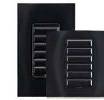
Midnight Black (Satin Finish)