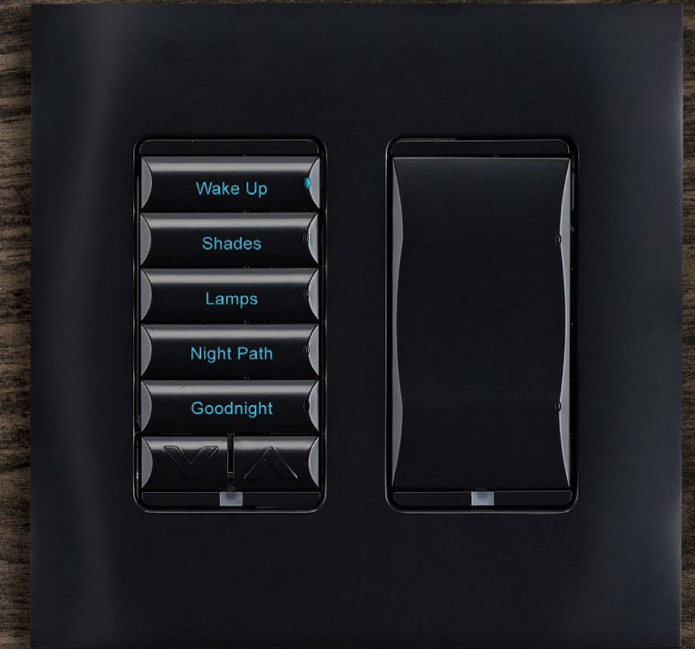
Keypad shown in actual size