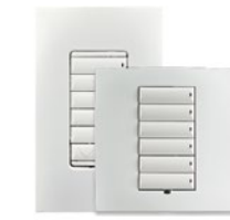
Snow White (Satin Finish)